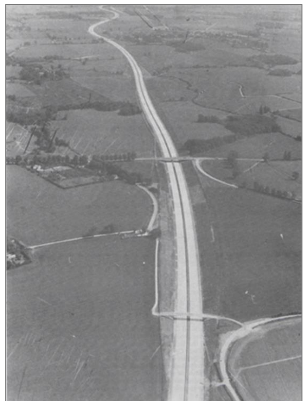
The newly built M11, east of Harlow, looking north. during the day.