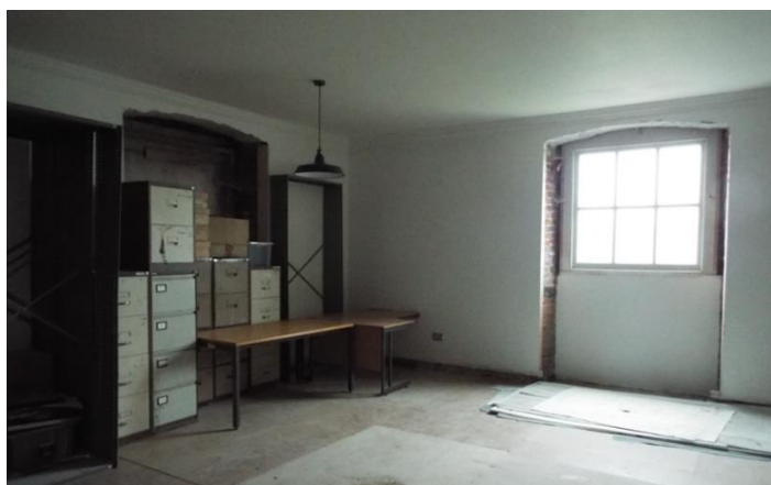
Up-stairs archaeology room as it looks today.

work early in the New Year. If all goes to plan this should allow us to return to the large scale