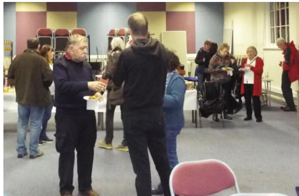
Members tucking in the buffet.

As has become the custom in recent years all the talks were given by group members on subjects of their choosing, recent work they had been doing, places they had visited etc.