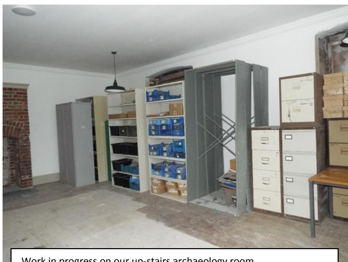
Work in progress on our up-stairs archaeology room.

finds processing project that was brought to an abrupt halt by the pandemic and in recent times has awaited completion of this room. The space will allow us to lay out our finds and come the end