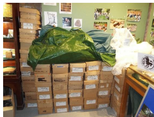
Roman pottery from Felmongers.