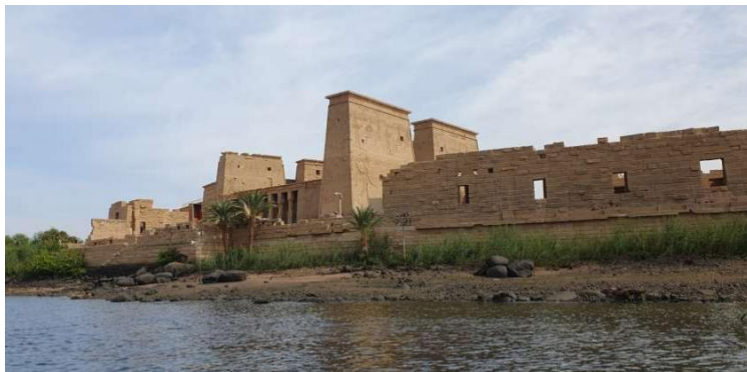
Philae Egypt.