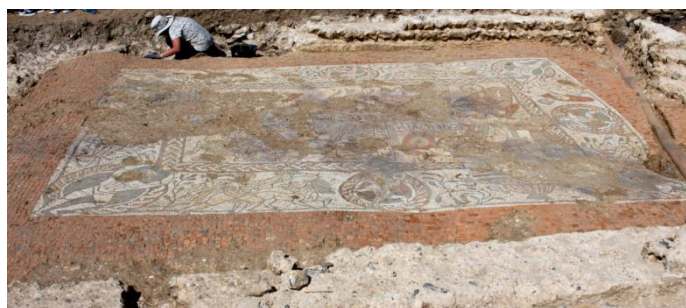
Boxford Roman mosaic.