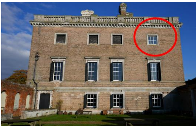
The location of our new archaeology room.